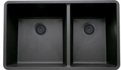
Model LX441128 shown in ANTHRACITE