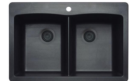
Model LX440220 shown in ANTHRACITE * basket strainer not included

DFX cutout templates available on our website