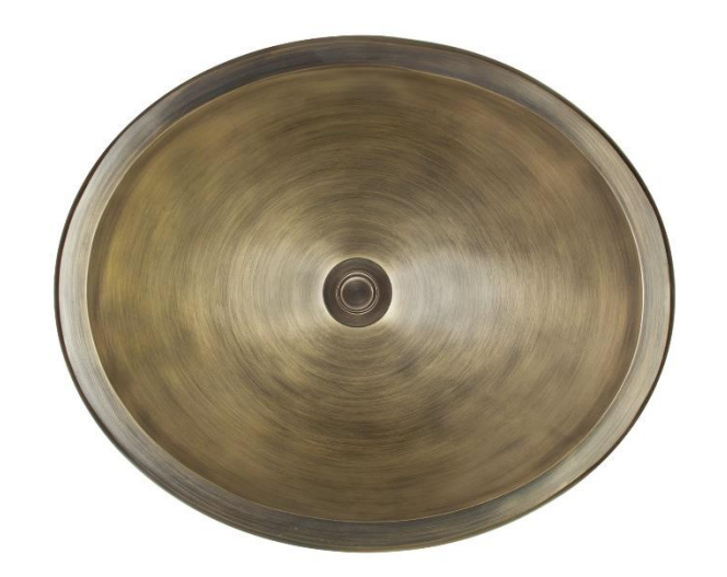
SHOWN IN AB